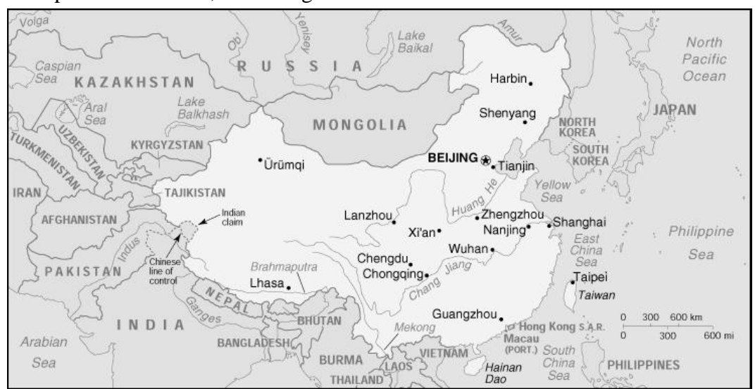
Map 1: China and its many neighbors

China today is roughly the size of the continental United States, located at comparable latitude on the globe. Unlike the U.S., China is bounded by only one ocean – the Pacific, on its east coast. Inland, China stretches deep into the deserts and mountain highlands of Central Asia, its far west bounded by India to the South, Kazakhstan and other former Soviet republics due West, and Mongolia to the North.